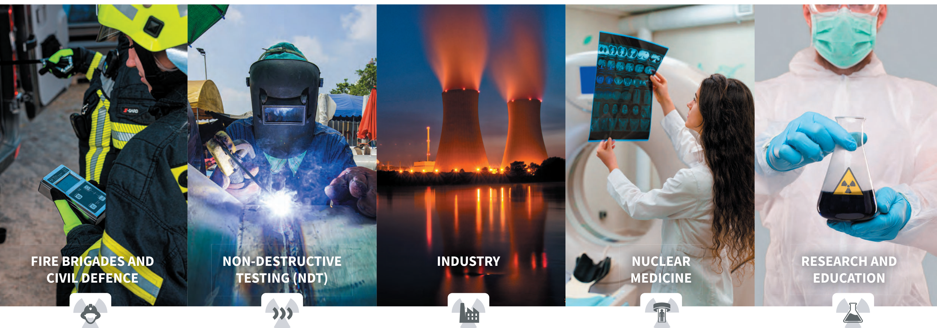
FIRE BRIGADES AND CIVIL DEFENCE