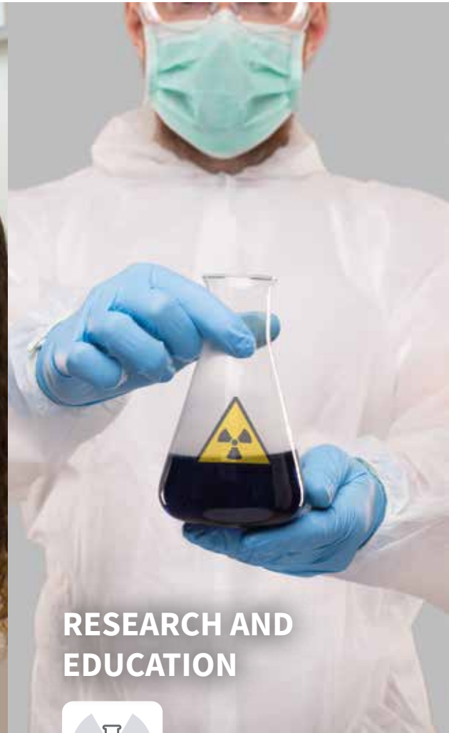
RESEARCH AND EDUCATION