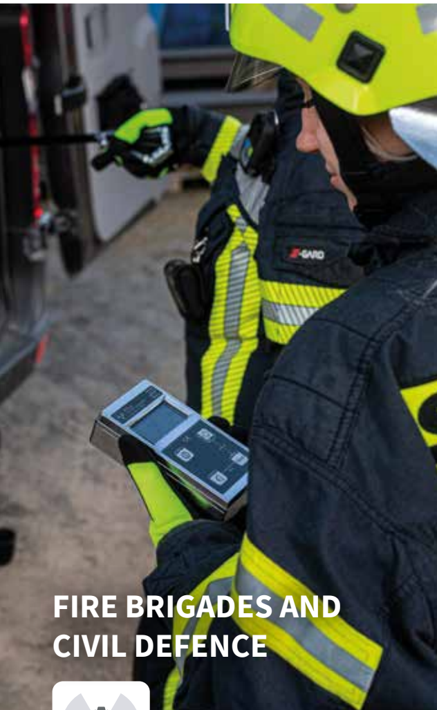
FIRE BRIGADES AND CIVIL DEFENCE