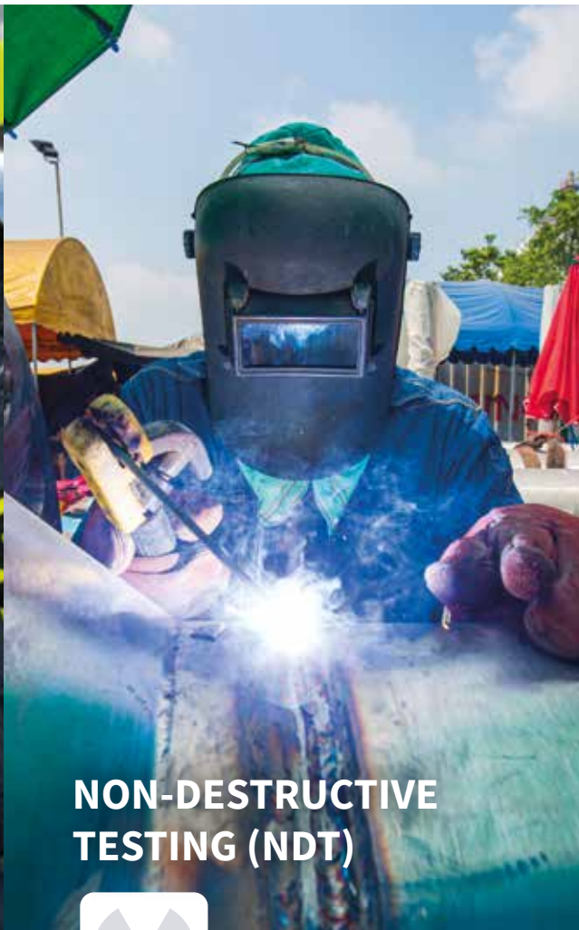
NON-DESTRUCTIVE TESTING (NDT)