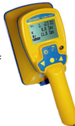
Contamination monitor CoMo-170 F for a simultaneous and selective \alpha -, \beta/\gamma -measurement. Detector surface 170 cm 2 .