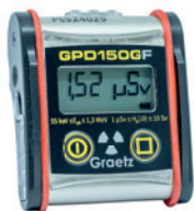
Alarm dosimeter GPD150GF or ED150 Alarm thresholds: 1, 15, 100, 250 mSv