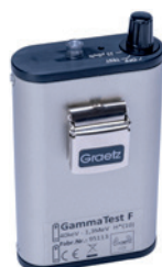
Dose rate alarm units GammaFlash, GammaTest F and GWL10m Alarm threshold for restricted areas: 25 µSv/h