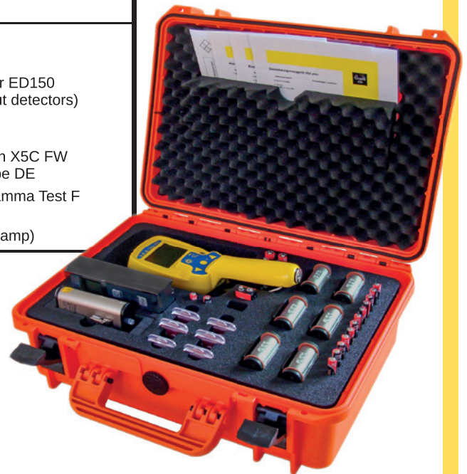
Measuring Kit GW-G with GPD150GF