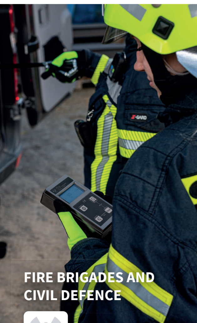
FIRE BRIGADES AND CIVIL DEFENCE