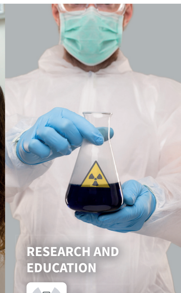
RESEARCH AND EDUCATION