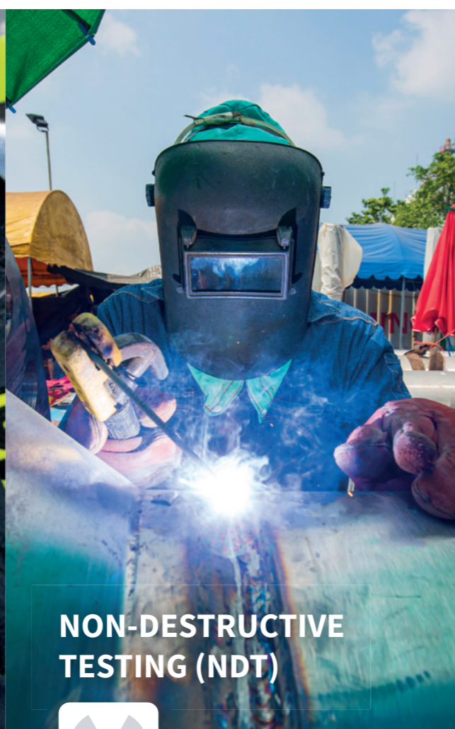
NON-DESTRUCTIVE TESTING (NDT)